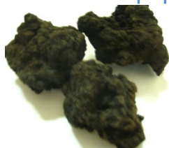
Figure 1: Gomutra Silasathu