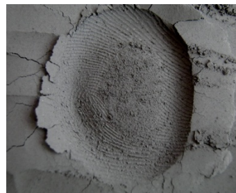
Figure 7: Lines of the thumb Finger