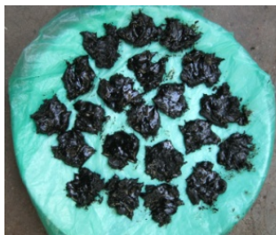
Figure 5: Pellets