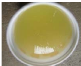
Figure 2: Cow's urine