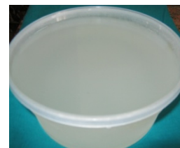
Figure 4: Kazhuneer kaadi